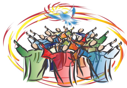
Congratulations to our Confirmation Candidates

The Catholic Parishes of Borehamwood St Teresa of the Child Jesus 291 Shenley Road, WD6 1TG SS John Fisher & Thomas More 28 Rossington Ave, WD6 4LA www.catholicparishesofborehamwood.org borehamwood@rcdow.org.uk